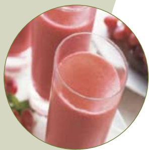
Juices & smoothies from whole fruits and vegetables.