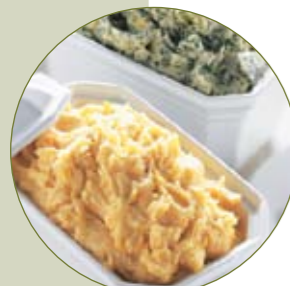
Churn herb butters from fresh cream.