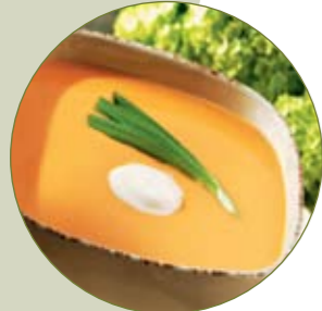
Cook steaming hot soup from fresh produce.