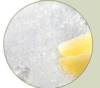
Crush 2 litres of ice in 3 seconds.