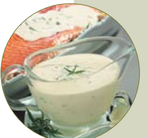
Create lump-free sauces and gravies without stirring.