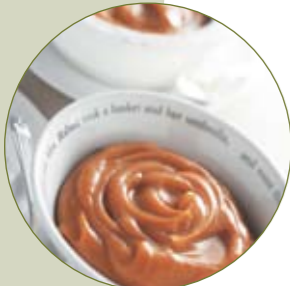
Purée fresh, natural baby foods, sauces and coulis.