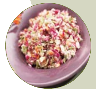
Wet chop nutrient-dense slaw that's rich in vitamin C.

Whole Grain Cookbook Free with purchase of "Dry Blade" Container! 41 fabulous recipes tailored to your "Dry Blade" container.