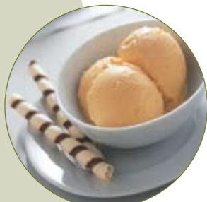
Make low-fat frozen treats in seconds.