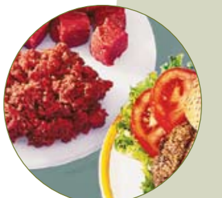
Grind meats, saving money and nutrition.