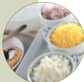
Dry chop onions, cheese and boiled eggs perfectly.