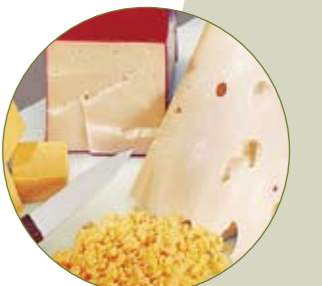
Grate cheeses perfectly in seconds.