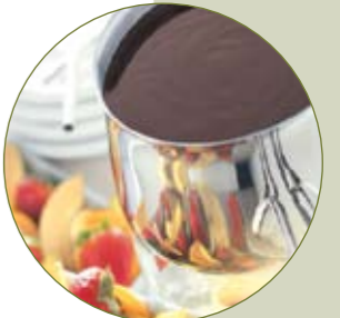
Fondue is quick and easy to make.